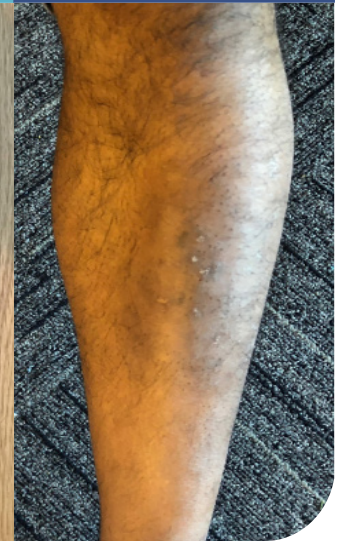
AFTER HOME GOECKERMAN